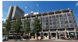
Branch in the Netherlands

Below are messages from the representatives of our three overseas locations, including existing offices in Vietnam and the United Kingdom.