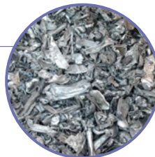
Aluminum shredder scrap

NEWSCON processes and supplies a variety of nonferrous scrap that has been shredded and sorted by the ENVIPRO Group and domestic waste disposal companies to meet the needs of domestic and international customers. In August 2023, we commenced operations at a branch in the Netherlands, using it as a base for export-import and trilateral trade between Europe and Asia. Through