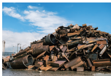
Steelmaking raw materials (ferrous scrap, etc.)

NEWSCON Inc. collects ferrous scrap at ports around Japan, controls quality according to customer requirements, and sells the scrap to steel mills (blast furnaces and electric furnaces) in Japan and overseas. With the expansion of steel demand in Vietnam and elsewhere in Southeast and Southwest Asia, the company is increasing the amount collected by establishing and expanding stockyards in Japan. As logistics methods for transport diversify, the company will make active use of large and small bulk ships and container transport, will build a sales structure covering Japan, neighboring Asia, and distant regions, and will engage in the sale of steel resources around the world.